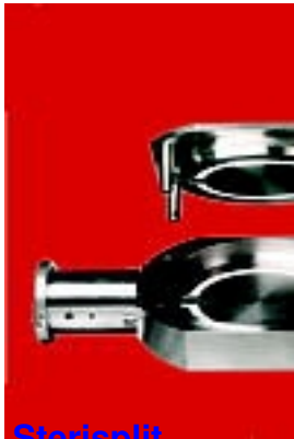
Sterisplit (Split Butterfly Valves)